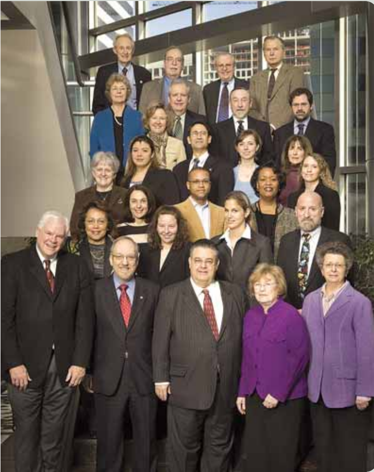
The APA's 2006–2007 Board of Trustees.

Year 2006 was fiscally strong for the APA and has enhanced and the medical and mental health communities.